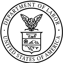
U.S. Department of Labor