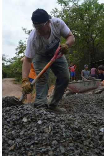
Figure 7 : Mixing in the Gravel