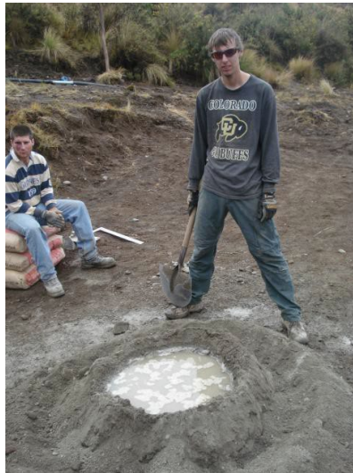
Figure 8 : Volcano with Water

This step might sound confusing, but it is actually pretty simple. Scoop an indentation into the center of your dry mix using your shovel. This molding of a wide “volcano” is necessary so that the water can be added smoothly. Basically you want to create a space for the water where the rest of the mix will keep it from running out. When the water is added, the reaction at the surface of the volcano acts as a barrier so that water doesn’t penetrate through.