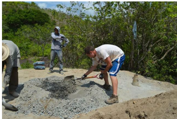
Figure 10: Mixing in Water

Since you want all of the concrete to be a good mixture, dry mixture outside of the crater is added to the rim to build up the sides. Basically, use your shovel to scoop the dry mix on the outside right into and around the water. There will come a time when the water starts seeping out and that’s when you know you really need to start moving. Mix the concrete by taking a scoopful of water and dry mix and flipping it over onto another part of the mix. Continue this motion while moving around the mix in a circle.