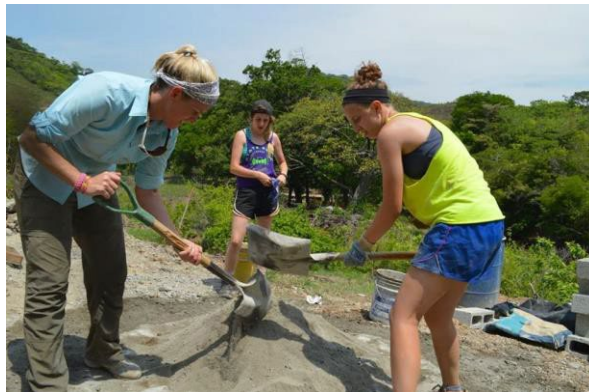
Figure 5: Cement-Sand Mix

be thought of as mixing the dry ingredients for a cake. Only this time your mix is a lot bigger and you are using a shovel.