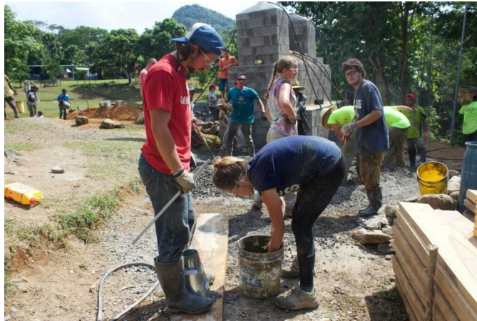
Figure 4: Measuring Cement

This step is based around the “Proportions” section. Therefore, the specific amount of cement you use will be based on how much concrete you need. If you are not sure, try using one bucket ( so two buckets sand and three gravel ). For this example, we will be using this amount. If you are using a different amount, just multiply or divide the ratio as necessary. Now that we have established how much cement is required for this example, use your shovel to fill the bucket with cement.