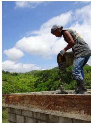
Figure 12 : Placing Concrete

At this point, the concrete has been consistently mixed. However, you need to place it right away to ensure that it does not start hardening in the wrong spot. Use your bucket, a wheelbarrow, or something similar to transport the concrete where you need it to be. Simply use your shovel to fill whatever you choose, bring it to your site, and carefully pour it wherever you need it.