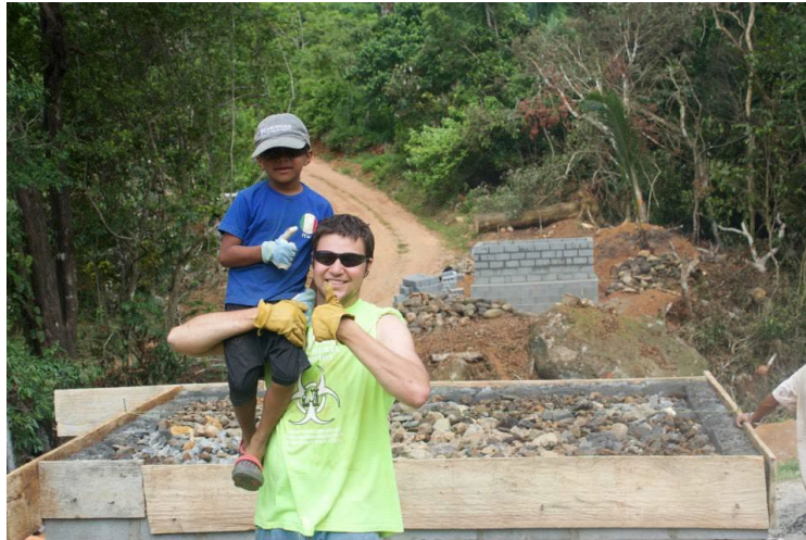
Figure 2 : Proper PPE

This is a crucial step when mixing concrete, and it is often over-looked. Please see the “Cautions/Warnings” section on page ___ for this step. If you are working with a group of people, it is often helpful to assign someone as “Safety Manager” and have them lead a quick safety session in which they go through all the possible hazards.