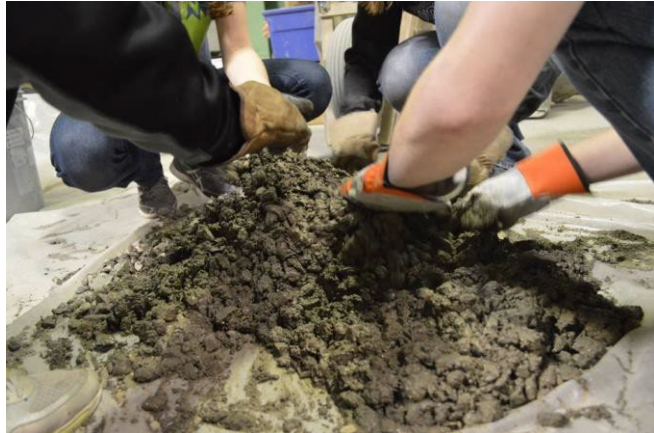
Figure 11 : Example of Consistency

Make sure the concrete is evenly mixed. There should be no dry pockets at this point. Mix as thoroughly as possible.