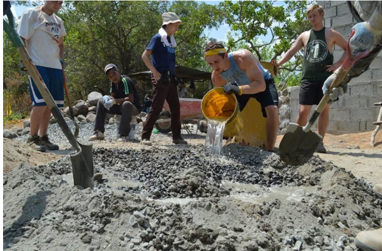
Figure 9: Adding Water

Fill your bucket with the desired amount of water and bring it over to your “volcano” mix. Carefully and slowly pour the water into the center of the volcano. The water will slowly dissolve into the volcano’s crater and wherever else it is touching. To ensure that the concrete will be mixed evenly, you need to continue to mix immediately. (See the next step.)