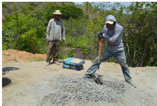
Figure 6: Placing the Gravel

Once the cement-sand mix is uniform, you are ready to add the gravel. For this example, we are using three buckets of gravel. Go to your gravel pile and use your shovel to fill the bucket with gravel. Bring the bucket to your workspace. Place the gravel just like you did the sand. CAREFULLY and slowly dump out the gravel low to the ground. To avoid the cement-sand mixture flying up, it is often smart to place the gravel around and right beside the mixture. Repeat for the next two buckets.