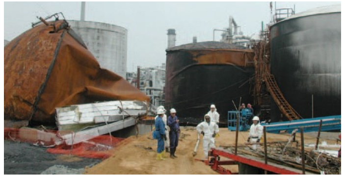
A view of the flammable storage tank involved in the accident at the Motiva Refinery.

Motiva had a hot work program that included written permits, but the program was inadequate. Hot work was allowed near tanks that contained flammables including