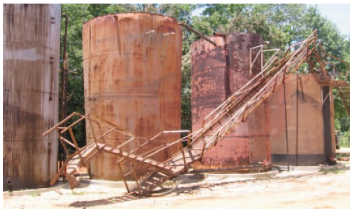
Tanks involved in the 2006 accident that killed three workers at the Partridge-Raleigh Oilfield.

Neither the contract company nor Partridge-Raleigh required written hot work permits. The contractor company did not provide hot work safety training to employees. Furthermore, Partridge-Raleigh did not have safety requirements for its oilfield contractors.