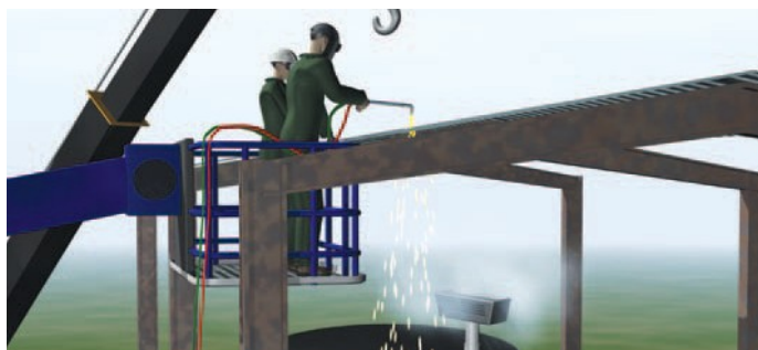
Depiction of hot work from the CSB's 2007 "Public Worker Safety" video illustrating the accident at Bethune Point.

Two workers were killed and another critically injured in an explosion involving a methanol storage tank at a municipal wastewater treatment facility in Daytona Beach, Florida. The explosion occurred while the three workers were cutting a metal roof located directly above the tank vent. Sparks showered from the cutting torch and ignited methanol vapor escaping from the vent, creating a fireball on top of the tank. A corroded and ineffective flame arrester 15 on the vent allowed the fire to propagate through the device, igniting methanol vapors and air inside the tank, resulting in an explosion.