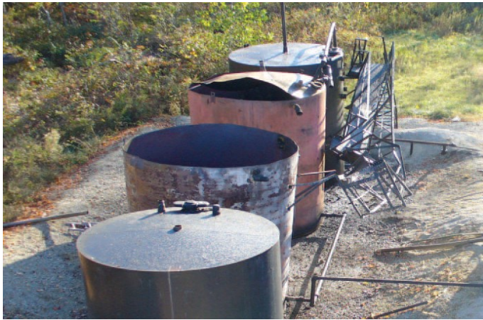
Oil storage tanks involved in fire and explosion at MAR Oil.