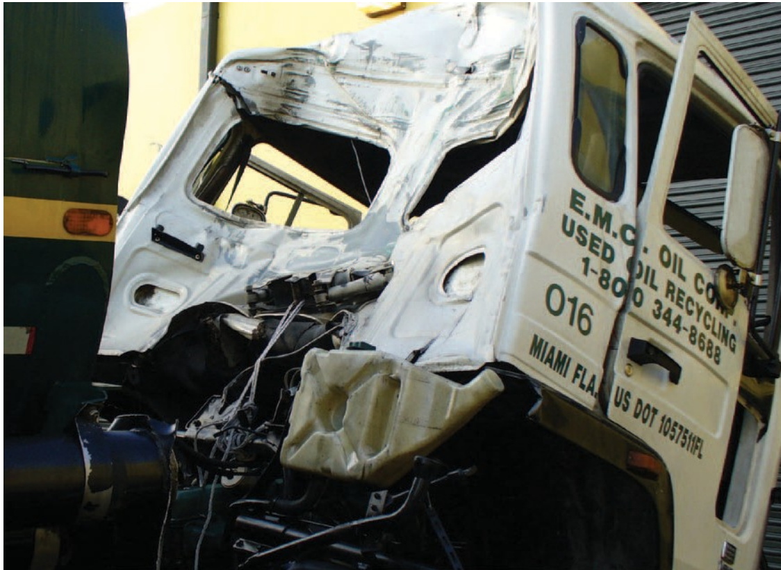
Damage to an oil tanker sustained from the December 2, 2008, explosion at EMC Used Oil Corporation.