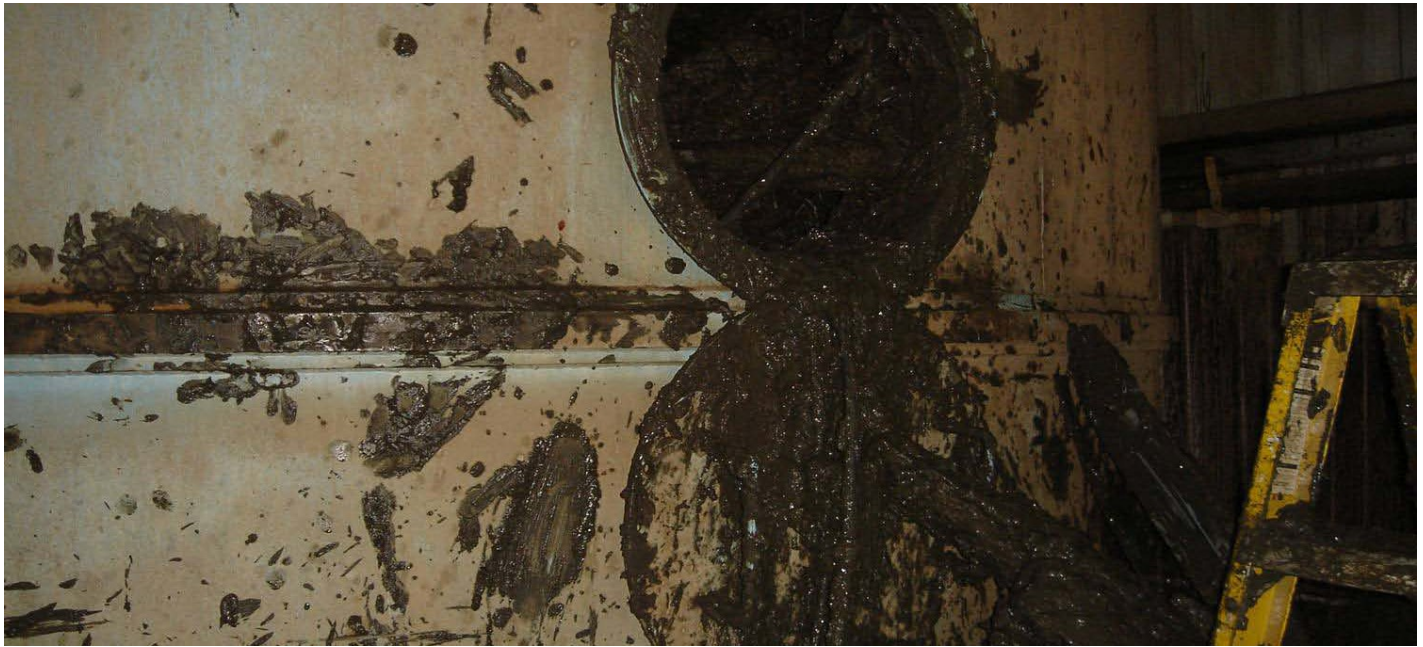
Potato-washing tank involved in the February 2009 accident at ConAgra Foods.