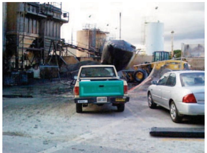
View of Philip Services Corporation following a October 7, 2008, waste oil storage tank explosion.

According to the HFD investigation, a PSC official asserted that the contractors were not authorized to weld within the dike area surrounding the tank, a hot work permit had not been issued for the welding, and combustible gas monitoring was not conducted. Conversely, the contracting company's personnel asserted that they believed that the work was authorized and that PSC had conducted combustible gas monitoring prior to the welding activity.