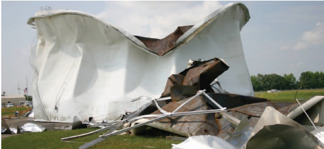
The gasoline storage tank at the TEPPCO McRae Terminal following the 2009 hot work accident that killed three workers.

gas monitoring are performed improperly. The ineffective hazard assessment and monitoring practices used in these cases failed to identify the presence of a flammable atmosphere in the area where hot work was being conducted.