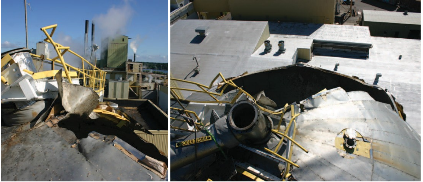
Views of the storage tank involved in the 2008 explosion at Packaging Corporation of America.