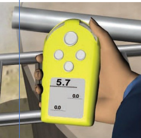
Example of a combustible gas detector used to test for the presence of flammable gas or vapor.

The 11 incidents are divided into two categories: 1) those cases where no gas monitoring was conducted; and 2) those where gas testing was improperly conducted.