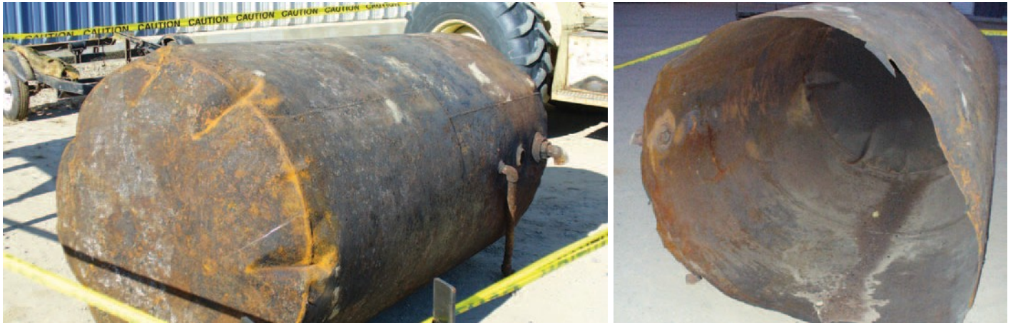
Exterior and interior views of the fuel tank involved in the hot work accident at A.V. Thomas Produce.

evaluation and the proper use of gas monitoring equipment likely would have alerted workers to the unsafe work conditions.